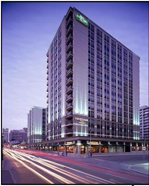
Courtyard Marriott 475 Yonge Street Toronto, Ontario