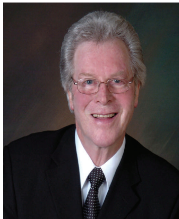
The Patrick J DeFazio Award