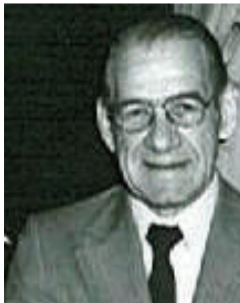
The Ed Hothersall Award